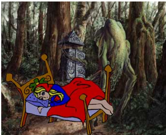
Goldilocks and the Floral Spuzzem? What is Beast Week coming to?

Let me relate this to the fable of Goldilocks and the Three Bears. You see, one day Goldilocks was running through the forests, and came upon this old house. She smashed in the window and what did she find? Three decks of cards, just sitting there on the kitchen table. So she tries, the first one, Pokémon . "Too easy," she thought, throwing the cards into the conveniently lit and unattended fireplace. Next came a pile of Vampire/Jyhad cards. "Oh my, I don't understand this game at all!" said Goldilocks, stapling the cards backwards against the wall to create a mural depicting the Battle at Wounded Knee. Only one stack remained— Magic: The Gathering . But before Goldilocks could play this new game, she was devoured ferociously by a passing Floral Spuzzem . As she was being eaten, her thoughts wandered to her high school biology class, where she'd often spent time daydreaming about the newest teen band sensation instead of paying attention to the teacher. "Oh my," mused she. "It's not often that one is eaten by a creature type—Spuzzem."